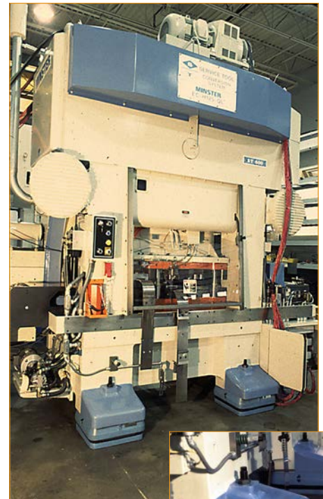
Container Press on VSML Spring Isolators