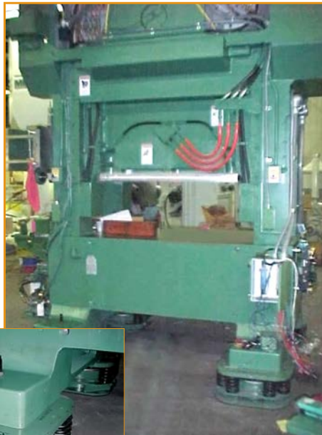
High-Speed Press on VSV Spring Isolators