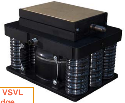
Custom VSVL with Wedge Leveling Device