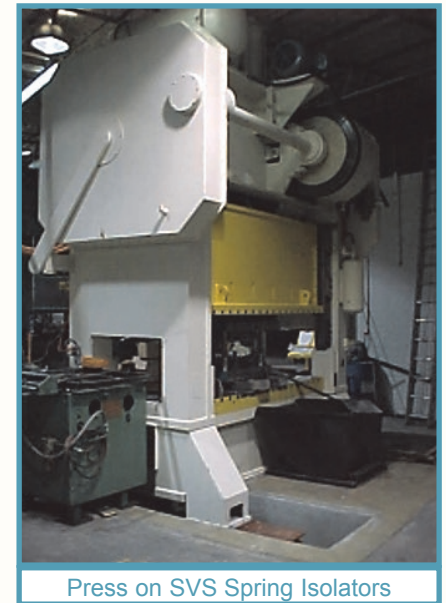
Press on SVS Spring Isolators

Vibro/Dynamics combines its low-stress isolator design philosophy with high-quality materials to ensure the longest effective isolator life. Our isolators are built to last even under the most severe operating conditions.