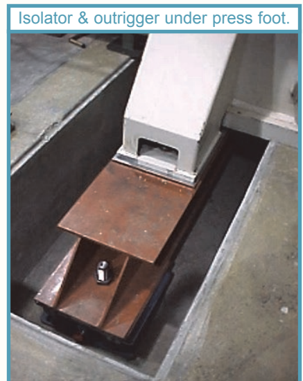
Isolator & outrigger under press foot.

Vibro/Dynamics is a registered trademark and SVX, SVS, SMS and Hy/Tuned are trademarks of Vibro/Dynamics LLC.